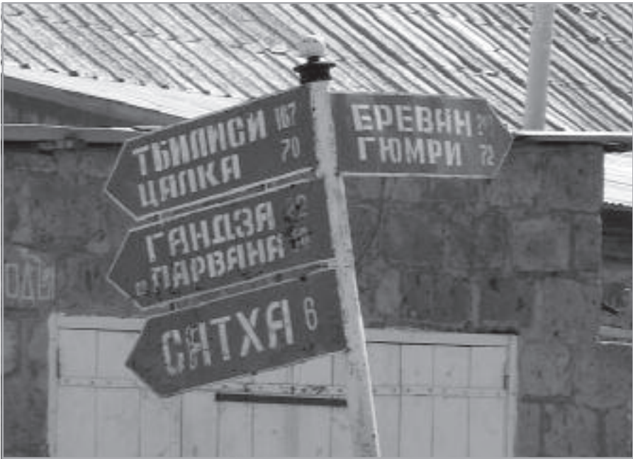
Intersection in Ninotsminda