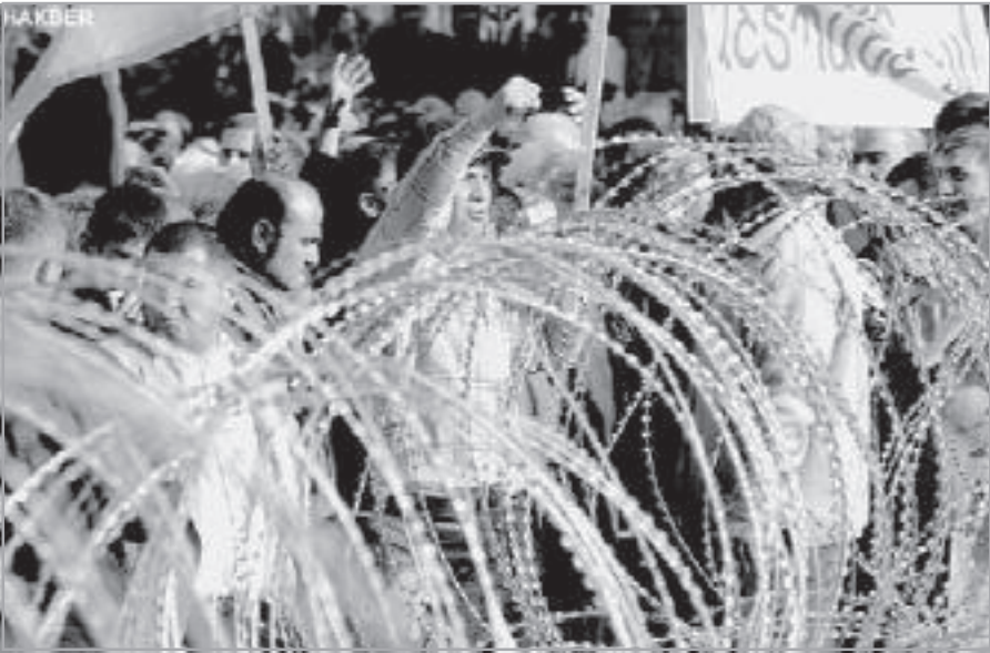
Confrontation at the President's administration building in Yerevan