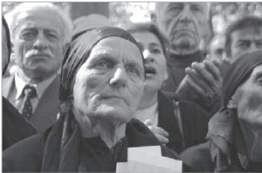
Hot autumn weather in Abkhazia