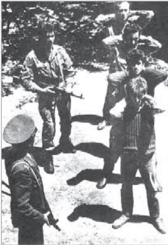
An amateur picture made at the beginning of the war in Karabakh. It is not clear who has captured whom