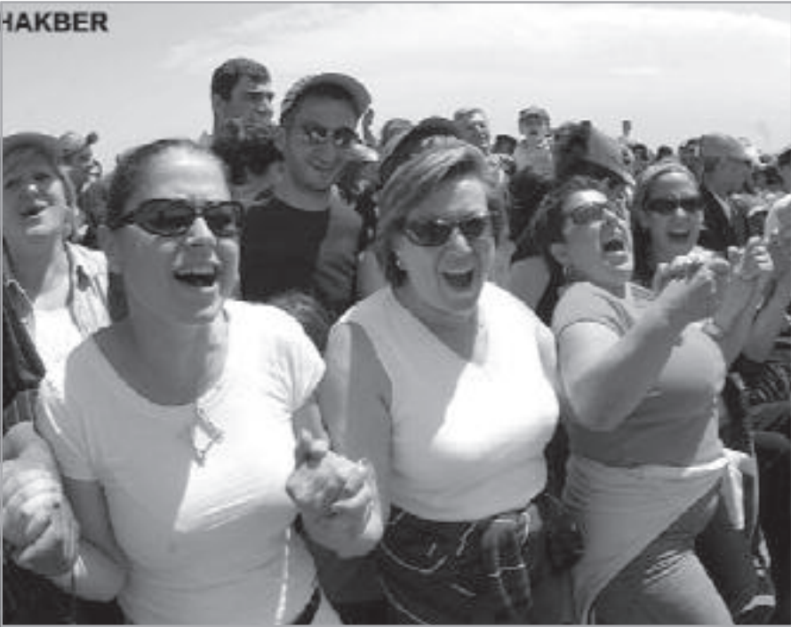
Round Dance of Unity at the foot of Mt. Aragats