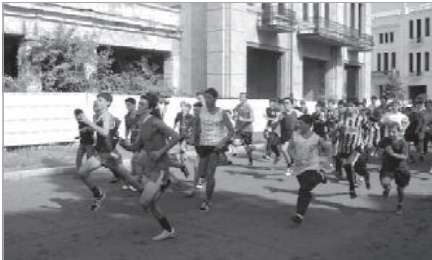
Youth cross-country race in Sukhum