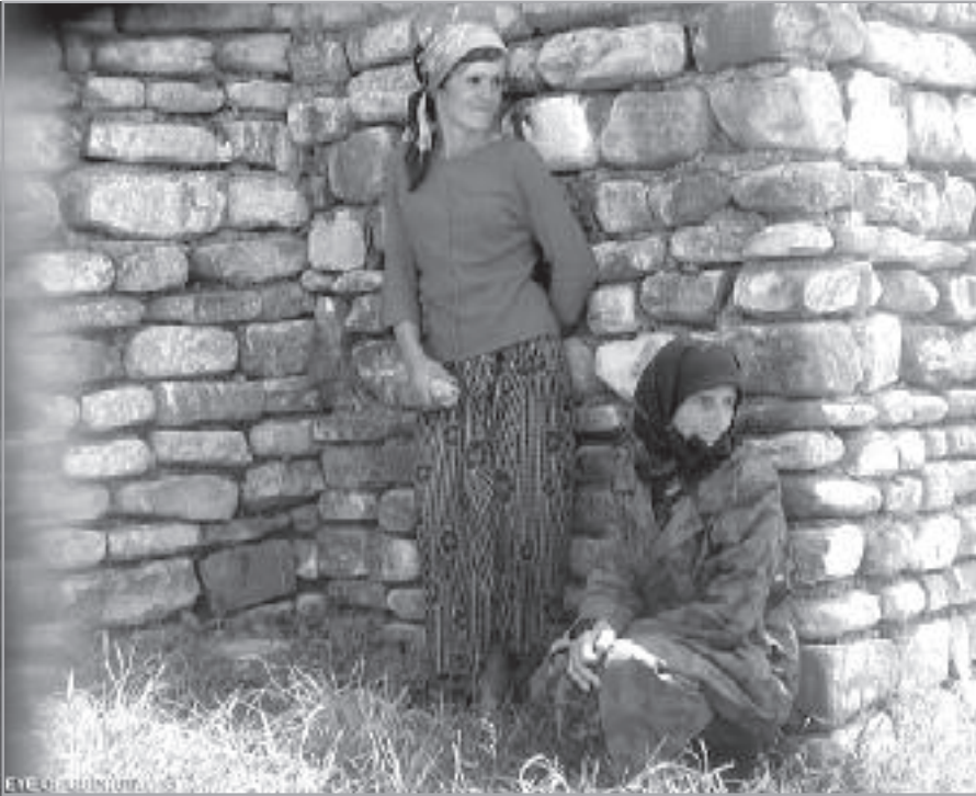
Chechens do not feel safe in Pankisi