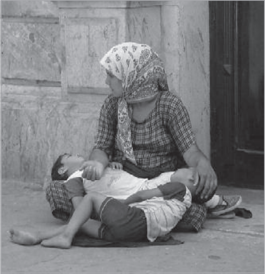
Early marriages are more common than legal ones in Azerbaijan